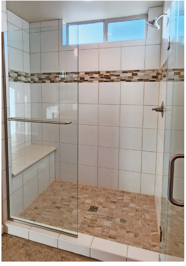
FURNITURE IS NOT INCLUDED