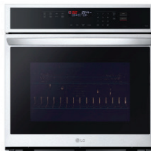
Single Convection Wall Oven WSEP4723F