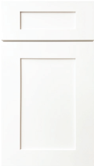
Newport Shaker Cabinet Style in Dove White Color