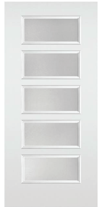
5-Lite Belleville Entry Door