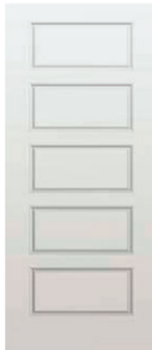
Rockport 8' Interior 6- Panel Doors

Interior Paint Egret White SW7570, with Pure White SW7005 Trim/Doors/Ceilings