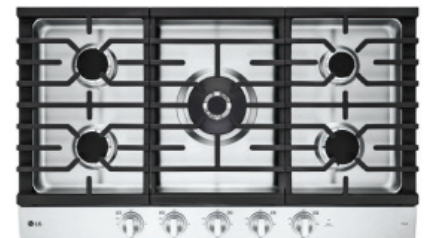
36" Gas Cooktop CBGJ3627S