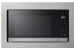
Microwave Oven & Trim Kit MSER2090S/MK2030NST