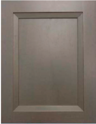
*IMAGE FOR STYLE ONLY CICERO CABINETS