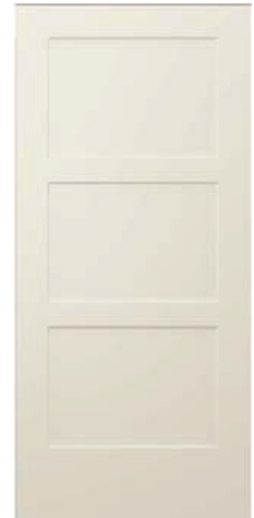
Birkdale Interior Doors 3 Panel Smooth *Painted to Match Trim