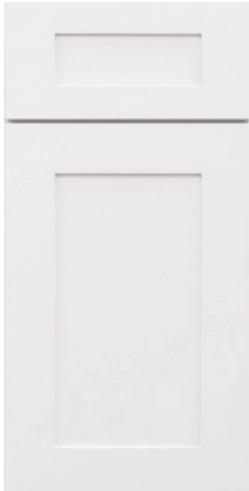
Cabinets: Shaker HDF White