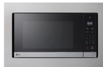
Microwave Oven & Trim Kit MSER2090S/MK2030NST