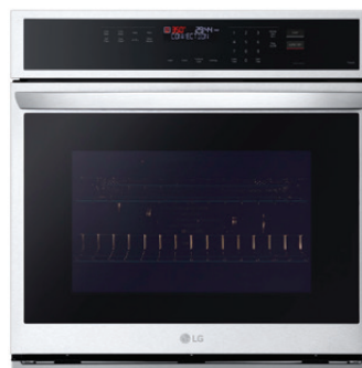
Single Convection Wall Oven WSEP4723F