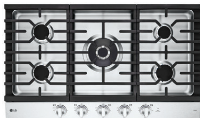
36" Gas Cooktop CBGJ3627S