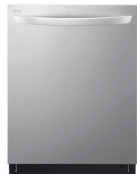
Top Control Dishwasher LDTH5554S

Colors may vary from shown. Subject to change.