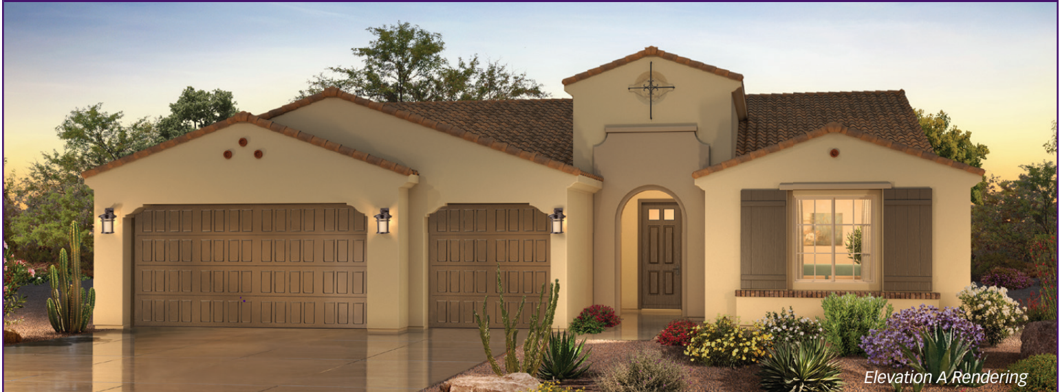
Elevation A Rendering

30972 S Blue Granite Ln, Oracle, AZ 85623