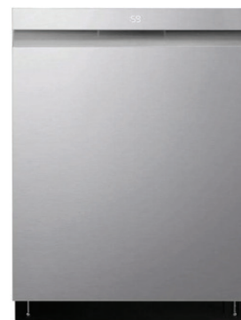
Top Control Dishwasher LDPH7972S

Colors may vary from shown. Subject to change.