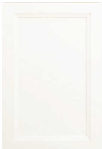
Cabinetry: Cicero Arctic White