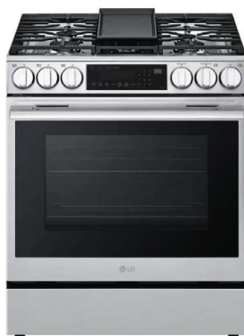
30" Convection Gas Range LSGL6335X