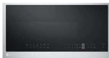
Over-the-Range Microwave Oven MVEL2033F