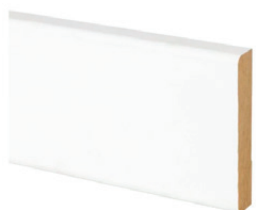
5" Contemporary Baseboards & 2 1/4" Casing