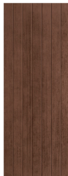
Therma-Tru Entry Door Full Plank *Painted per Exterior Color Scheme